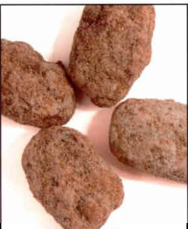
233 CINNAMON ROASTED PECANS 1 Lb. $