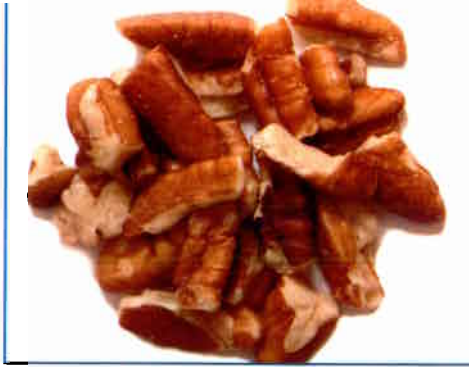
201 PECAN PIECES Raw, 1 Lb. $