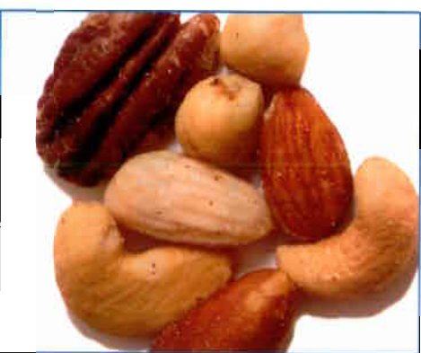
205 ROASTED & SALTED MIXED NUTS 1 Lb. $