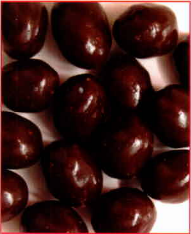
215 DARK CHOCOLATE COVERED PEANUTS 1 Lb. $