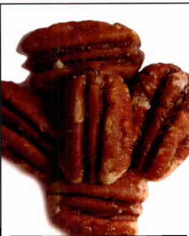
231 ROASTED & SALTED PECANS 1 Lb. $