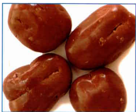
204 CHOCOLATE COVERED PECANS 1 Lb. $