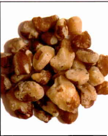
243 BLACK WALNUTS Raw, 1 Lb. $