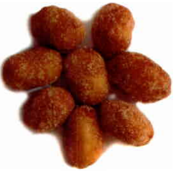
237 HONEY ROASTED PEANUTS 1 Lb. $