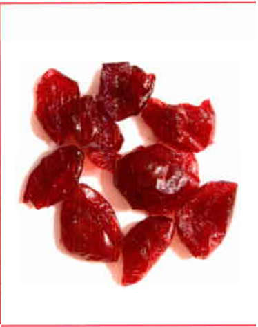
225 DRIED SWEETENED CRANBERRIES 1 Lb. $