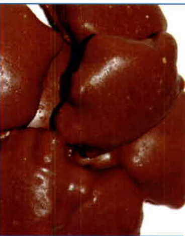
207 CHOCOLATE CARMEL PECAN PATTIES 1 Lb. $