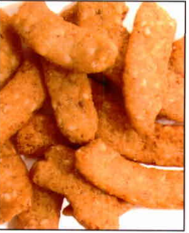
254 PLAIN SESAME STICKS 1 Lb. $