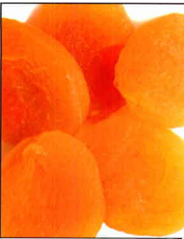
249 DRIED TURKISH APRICOTS 1 Lb. $