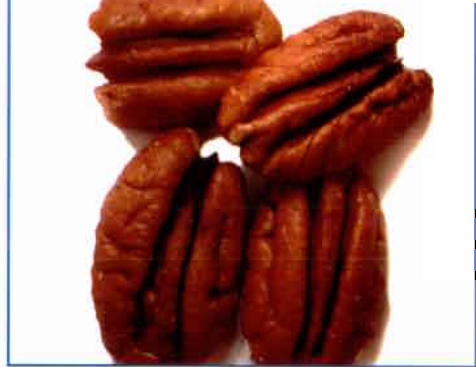
202 PECAN HALVES Raw, 1 Lb. $