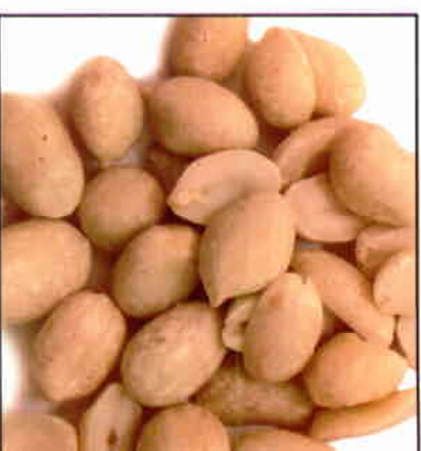
236 SKINLESS PEANUTS Raw, 1 Lb. $