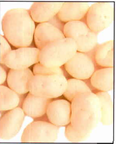
252 YOGURT COVERED RAISINS 1 Lb. $