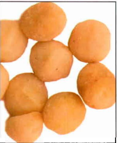
247 ROASTED & SALTE MACADAMIA NUTS 1 Lb. $