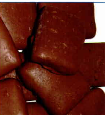
208 CHOCOLATE ENGL TOFFEE BARS 1 Lb. $