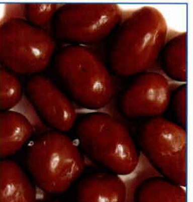
210 CHOCOLATE COVERED RAISINS $