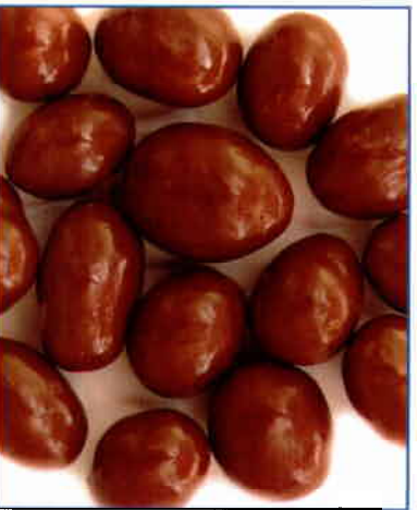
209 CHOCOLATE COVERED PEANUTS 1 Lb. $