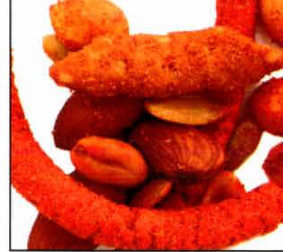
256 SPICY HOT PUB M 1 Lb. $