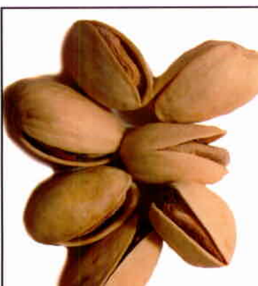
244 ROASTED & SALTE NATURAL PISTACHIOS 1 Lb. $