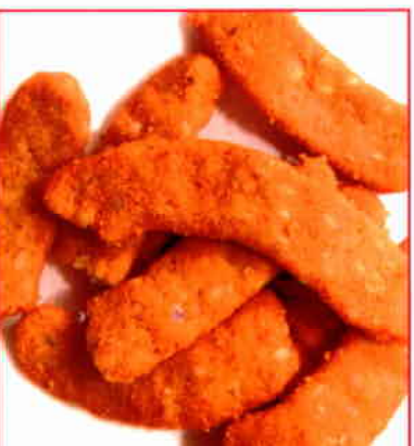
222 CHEESE FLAVORE SESAME STICKS 1 Lb. $