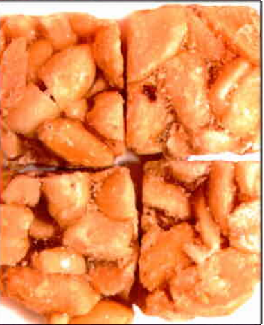
239 OLD FASHIONED PEANUT SQUARES 1 Lb. $