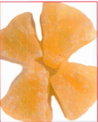
228 DRIED SWEETENED PINEAPPLE CHUNKS 1 Lb. $