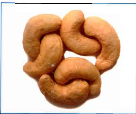
203 ROASTED & SALTED CASHEWS 1 Lb. $