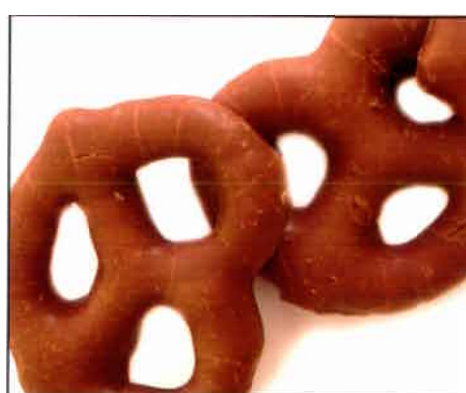
259 CHOCOLATE COVERED PRETZELS 1 Lb. $