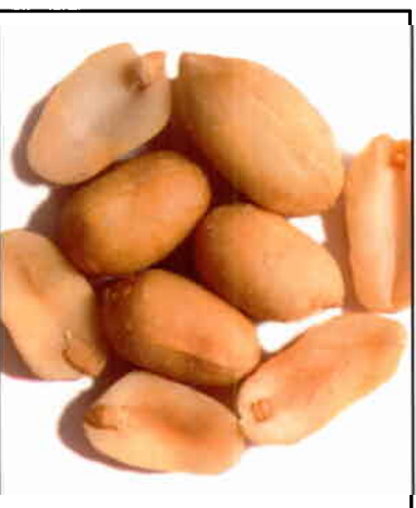
235 ROASTED & SALTED VIRGINIA PEANUTS 1 Lb. $