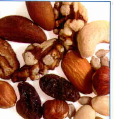
212 ENERGY MIX (Raw, no added salt or sugar) 1 Lb. $