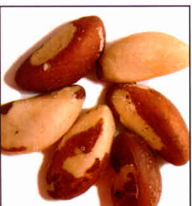
246 BRAZIL NUTS Raw, 1 Lb. $