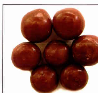
260 CHOCOLATE COVERED COOKIE DOUGH BITS 1 Lb. $