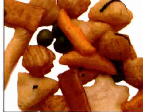
255 ORIENTAL FANTASY MIX 1 Lb. $