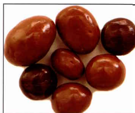
257 CHOCOLATE COVERED BRIDGE MIX 1 Lb. $