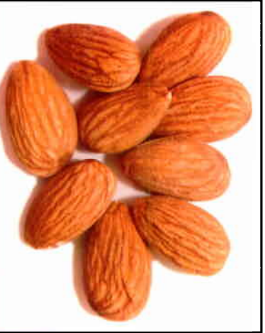
241 ROASTED & SALTED ALMONDS 1 Lb. $