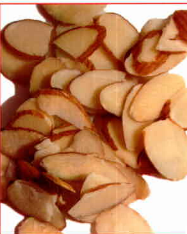
219 NATURAL SLICED ALMONDS Raw, 1 Lb. $