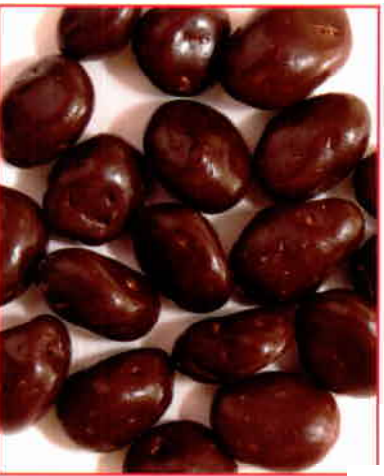
216 DARK CHOCOLATE COVERED RAISINS 1 Lb. $