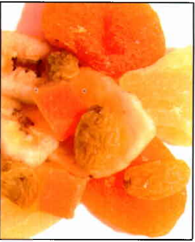
251 TROPICAL FRUIT MIX 1 Lb. $