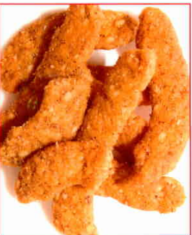
221 CAJUN FLAVORED SESAME STICKS 1 Lb. $