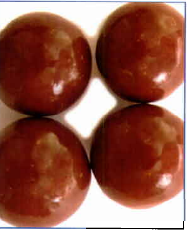
211 CHOCOLATE MALTED MILK BALLS 1 Lb. $