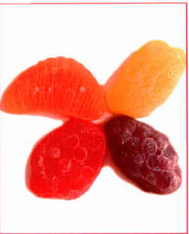
227 FRUIT SNACKS 1 Lb. $