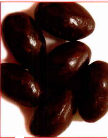
214 DARK CHOCOLATE COVERED ALMONDS 1 Lb. $