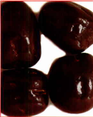
213 DARK CHOCOLATE COVERED PECANS 1 Lb. $