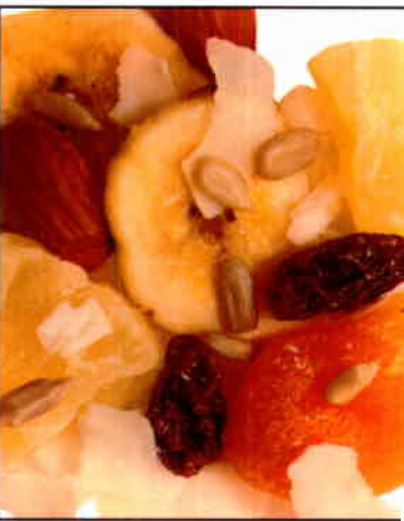
250 SUNSHINE MIX 1 Lb. $