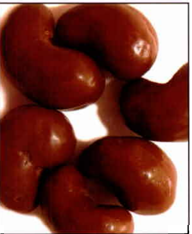
245 CHOCOLATE COVERED CASHEWS 1 Lb. $