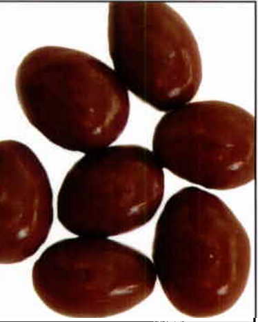
242 CHOCOLATE COVERED ALMONDS 1 Lb. $