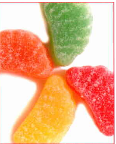
229 ASSORTED FRUIT SLICES 1 Lb. $