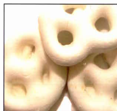
258 YOGURT COVERED PRETZELS 1 Lb. $