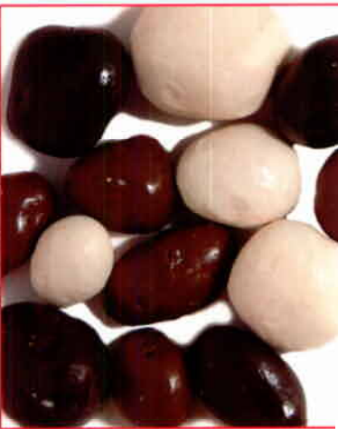
226 TRIPLE TREAT CRANBERRIES (Dark, milk, yogurt) 1 Lb. $