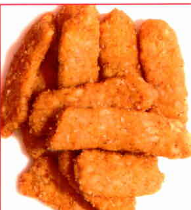
220 BARBEQUE FLAVORED SESAM STICKS 1 Lb. $