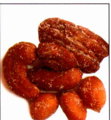
248 HONEY ROASTED MIXED NUTS 1 Lb. $