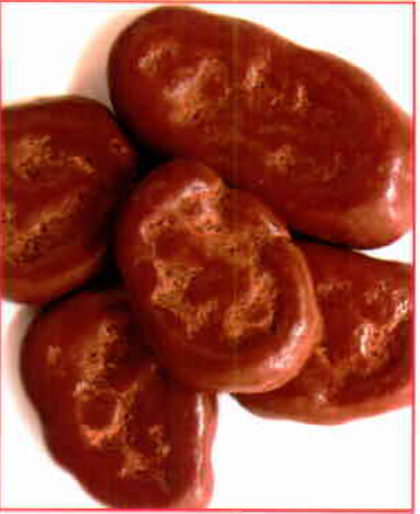
217 CHOCOLATE COVERED BANANA CHIPS 1 Lb. $