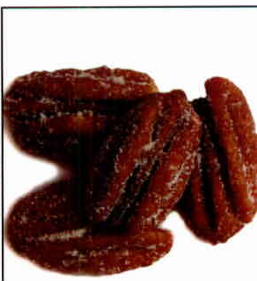
232 HONEY ROASTED PECANS 1 Lb. $