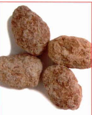
223 CINNAMON ROASTED ALMONDS 1 Lb. $