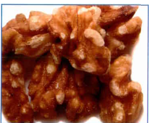
206 ENGLISH WALNUTS Raw, 1 Lb. $