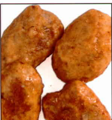
234 BUTTER TOFFEE PECANS 1 Lb. $