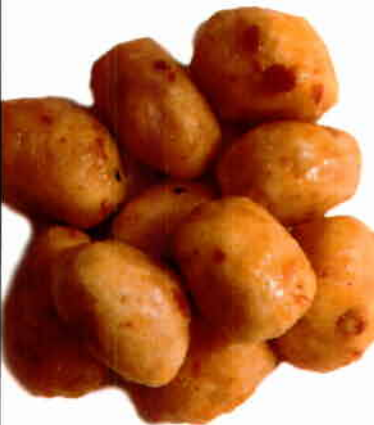
238 BUTTER TOFFEE PEANUTS 1 Lb. $