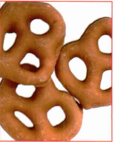
218 PEANUT BUTTER COVERED PRETZELS 1 Lb. $