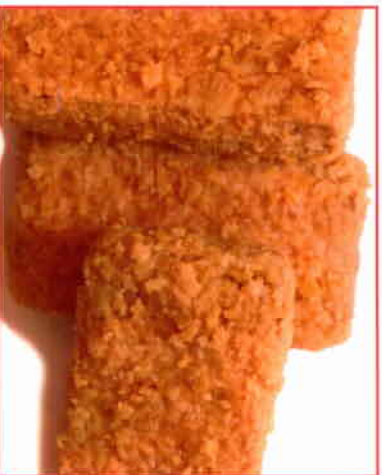
230 PEANUT BUTTER LOGS 1 Lb. $