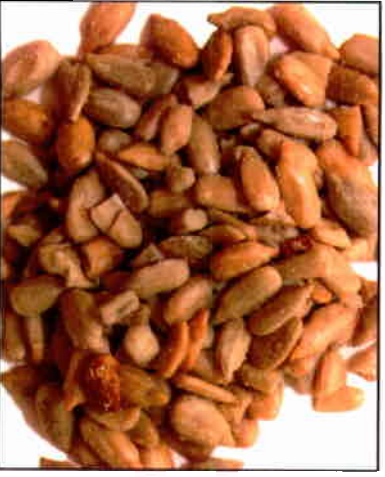
253 ROASTED & SALTED SUNFLOWER MEATS 1 Lb. $