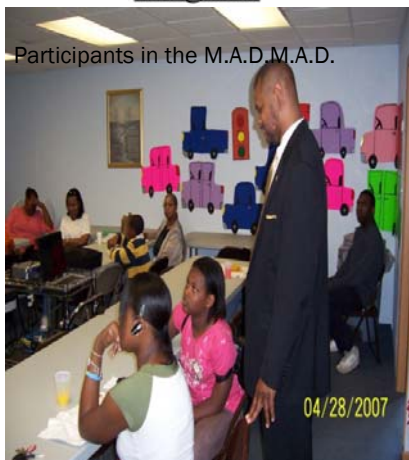
Participants in the M.A.D.M.A.P.